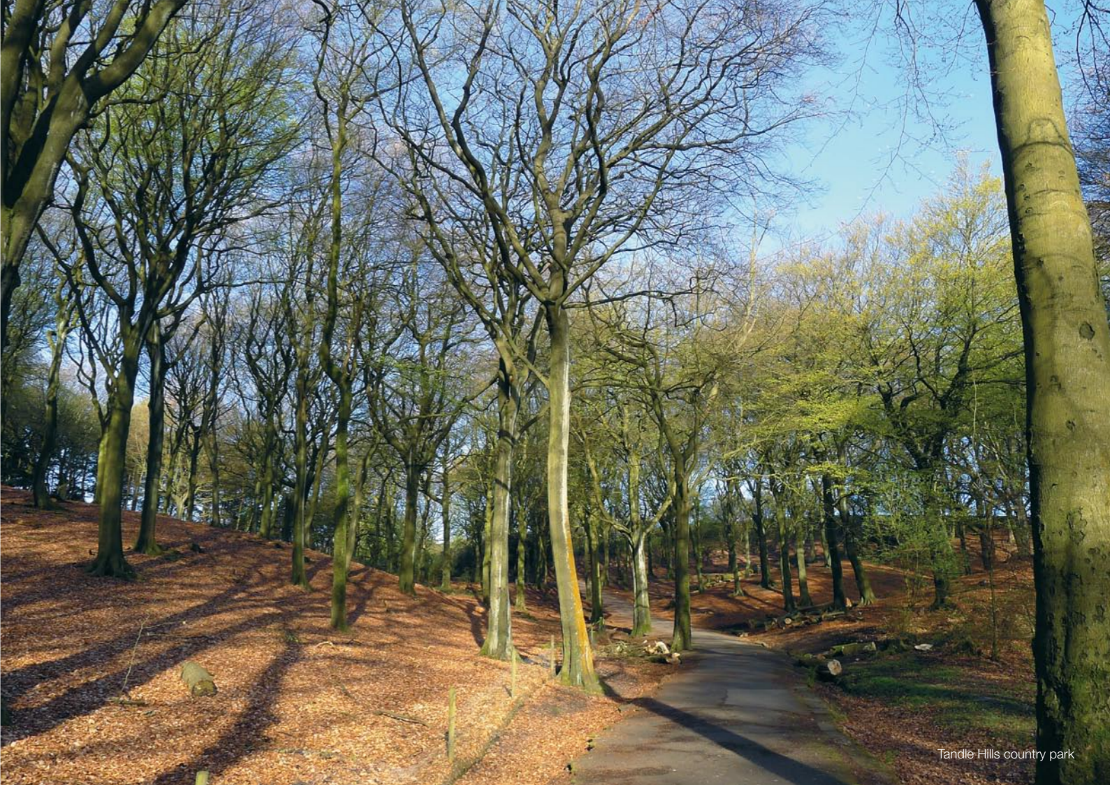
Tandle Hills country park

T: 0161 627 2608 E: env.tandlehill@oldham.gov.uk