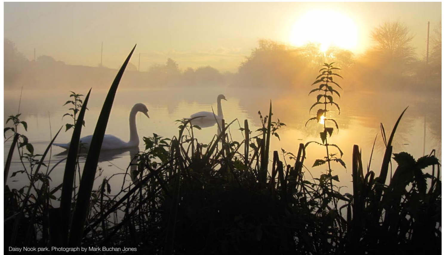
Daisy Nook park.

Come along and make sun-catchers using natural materials, card and ribbons. Children must be accompanied by an adult. Cost £2.00 per child. Booking essential. Please call 0161 770 4056