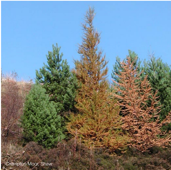
Crompton Moor, Shaw

Help plant shrubs and trees on Crompton Moor to improve the habitat and benefit the wildlife in the woodlands on the moors. Please wear suitable old clothing and appropriate footwear.