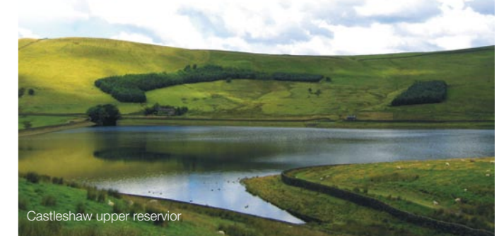
Castleshaw upper reservoir

A morning walk around the Castleshaw valley looking for wildlife. Meet at car park near Centre.