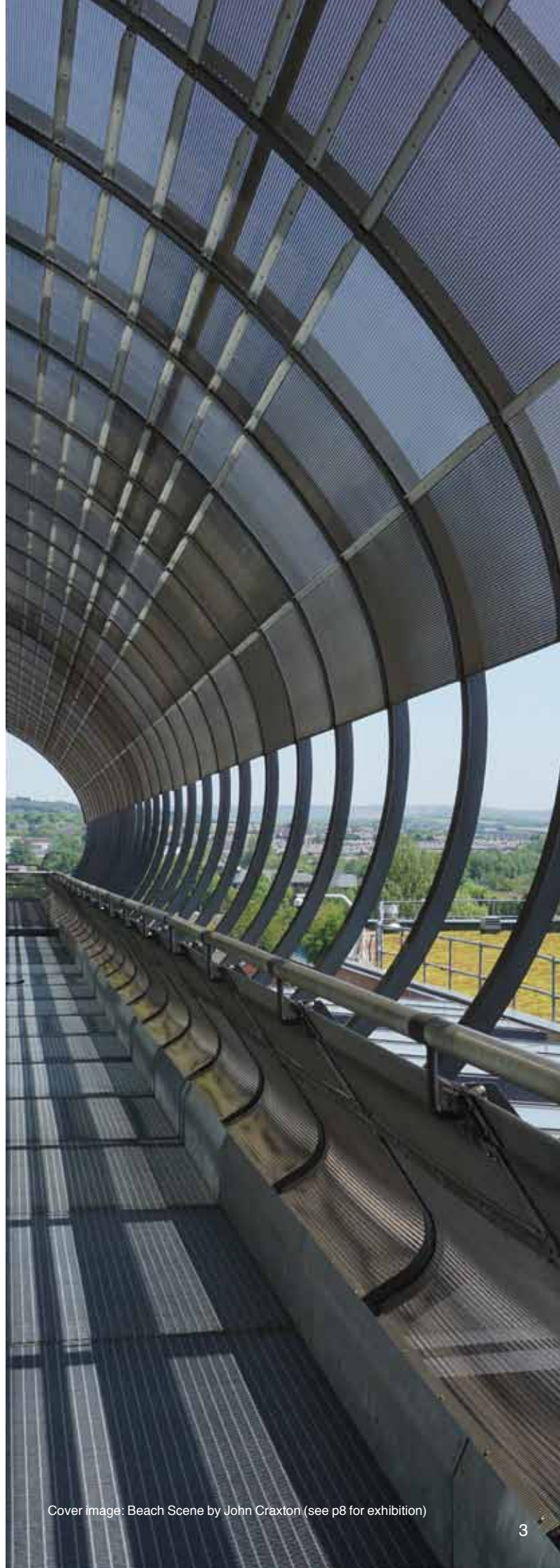
Cover image: Beach Scene by John Craxton (see p8 for exhibition)