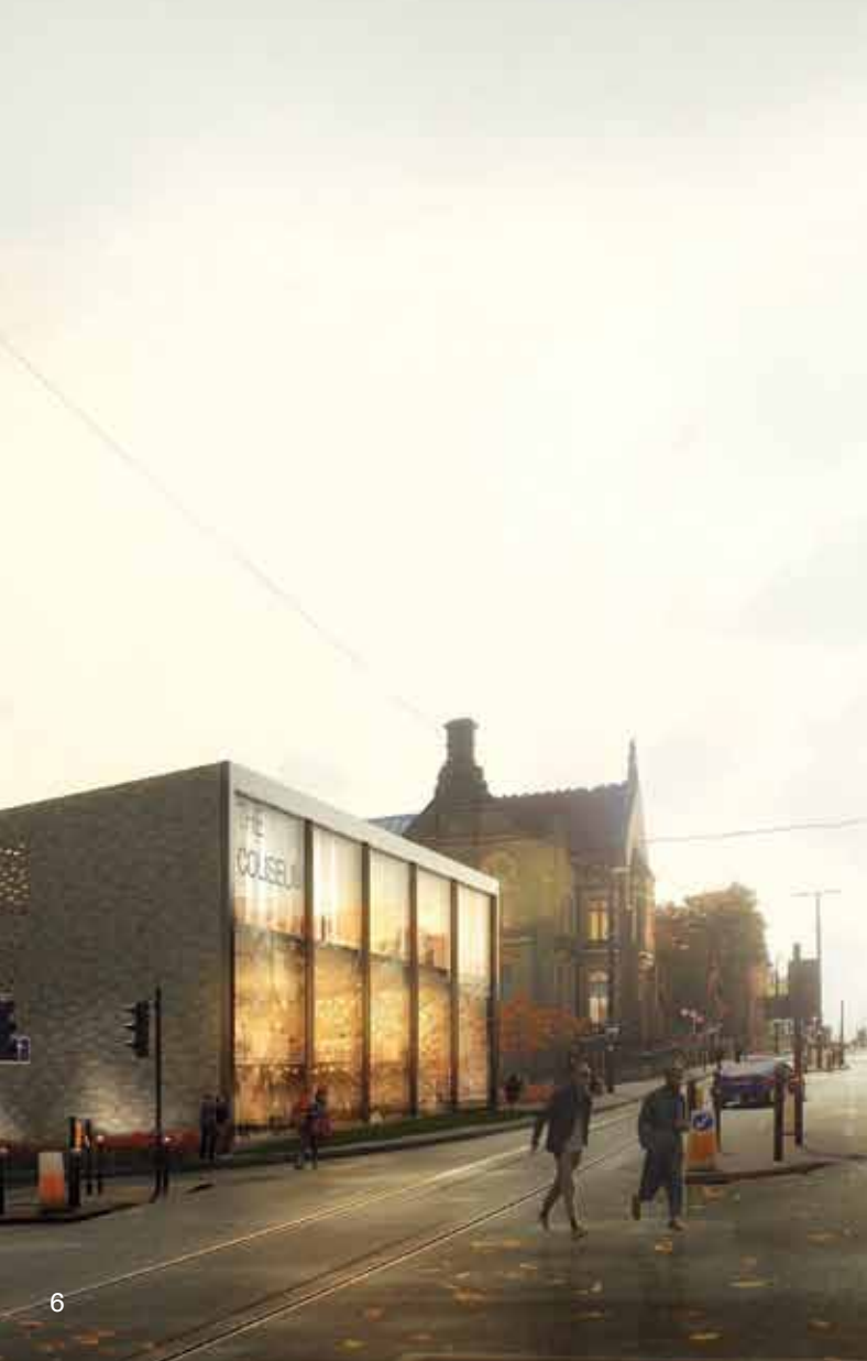
Image: Impression of the new building from Union Street

To get you started we'll be displaying the poster that advertised our first ever exhibition on 1 August 1883. Perhaps you'll be inspired to design a new poster telling us what visitors might see in our new spaces in a few years time.