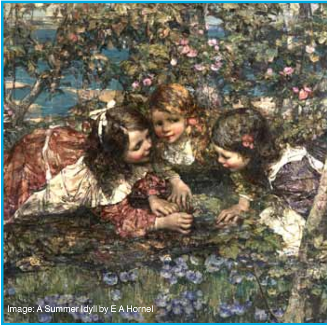
Image: A Summer Idyll by E.A. Hornel

Uncover extraordinary tales of the First World War in Oldham Stories.