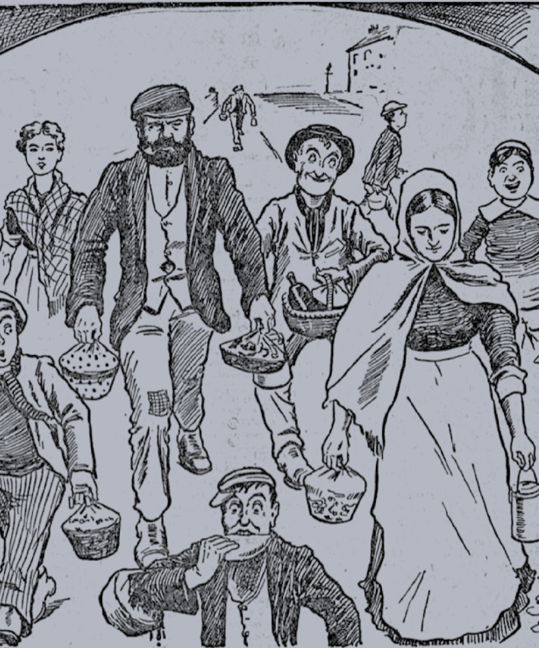
DINNER CARRIERS' PARADE.