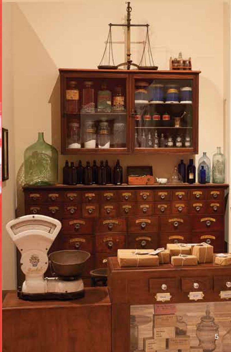
The Chemist's Shop in Oldham Stories

'I would put in some old hair-straighteners because they might not exist in the future!'